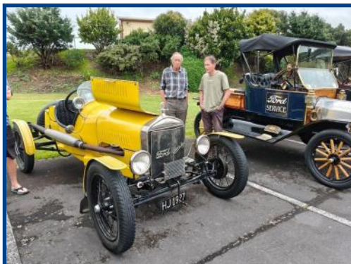
Model T Speedster