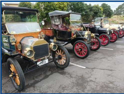
Some polished brass!