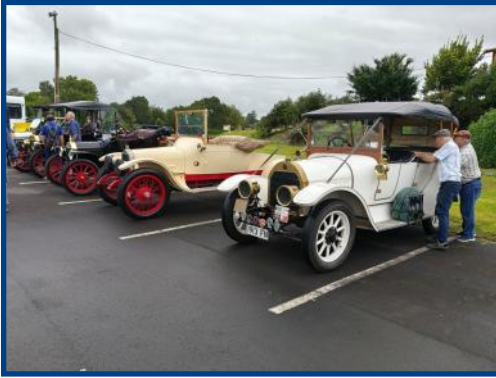
FN and Sunbeam in foreground