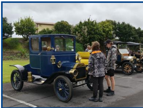
Russell Vincent's Model T Coupe