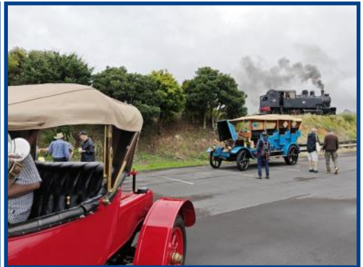
Another view of the GVR Train...