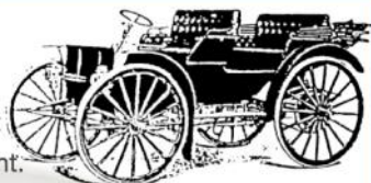
INTERNATIONAL AUTO BUGGY

NO, we did not supply the original gasket for this one, but if called upon we could produce a satisfactory replacement.