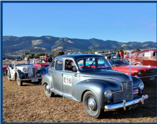
Above: Our 1951 Jowett Javelin ready for the Team's Relay Challenge