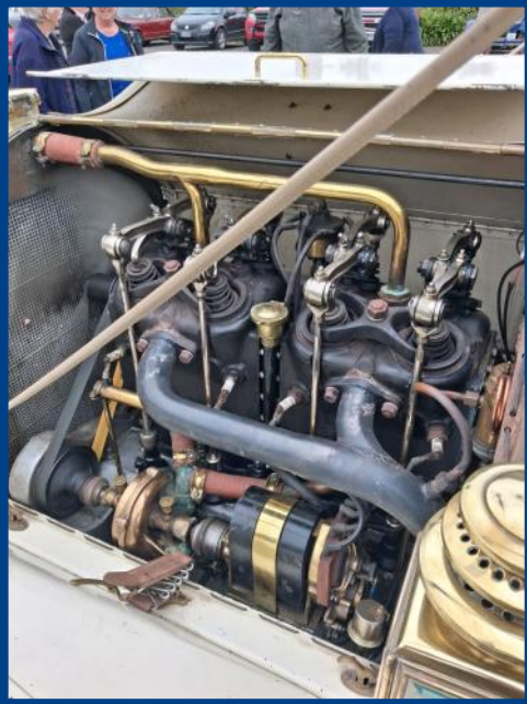
Under the "Hood" of the stunning 1911 Stoddard-Dayton