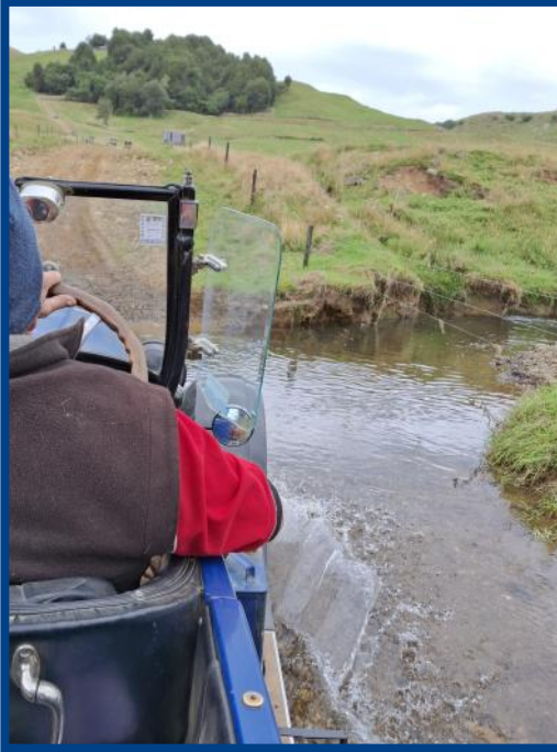
Ford view from the back of Betsy.