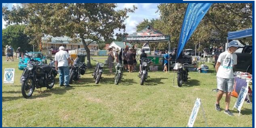
Below: Some of the 23 bikes at our stand.