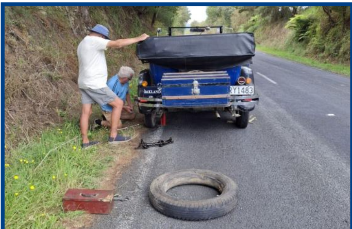
Left: Oops, a running repair for Team Betsy.