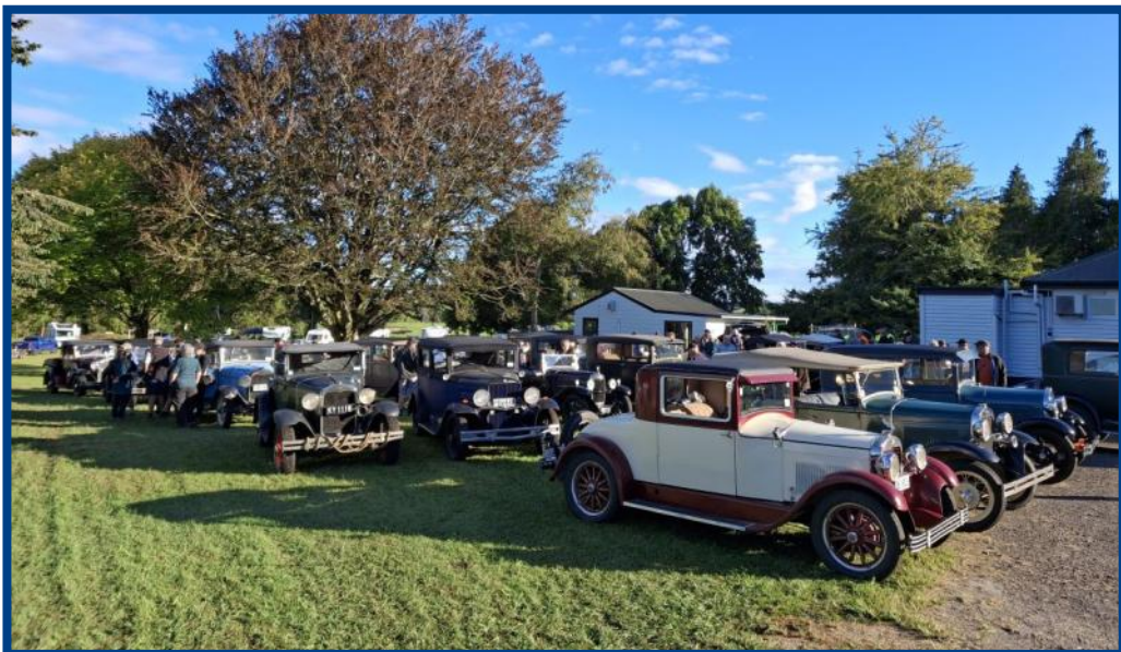
Above: The Vintage line-up at the start