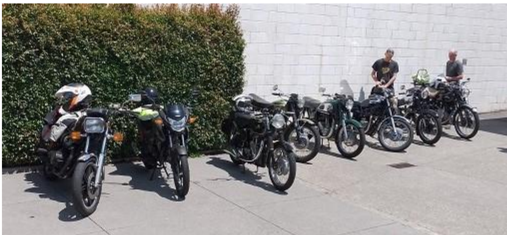
The bike line-up in the backyard for the first meeting of the year.