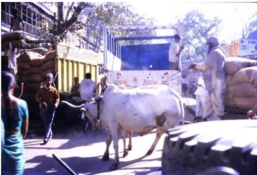
Thank you David! A very familiar tale of India and its "Drive by Horn" mentality!

The rural roads were little better. The overtaking vehicle seemed to have right of way. On one occasion we came across a blocked main road with both lanes meeting with opposing trucks also in both lanes. Complete impasse. So I engaged low ratio and four wheel drive and went down the embankment, through some paddy fields and back up when we got to the end of the tail back. Railway crossings were interesting too. They each had a little hut with a man who worked the gates and there was a book in which we were invited to write complaints. It was not uncommon that after the gates were opened to have both lanes blocked with opposing traffic.