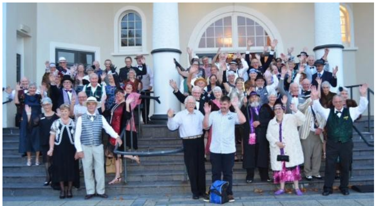
Entrants gather at the Town Hall for the Rally Dinner